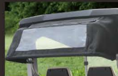
Retractable Golf Bag Cover