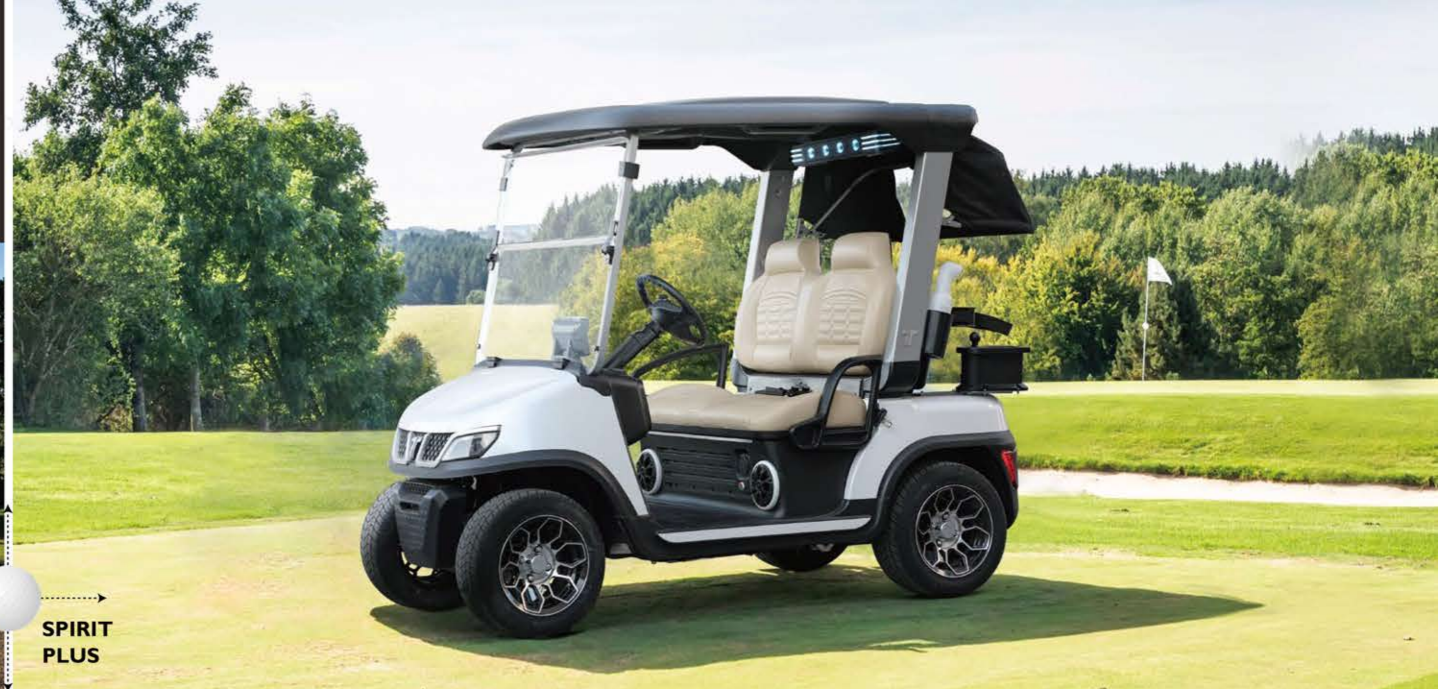
→ SPIRIT PLUS