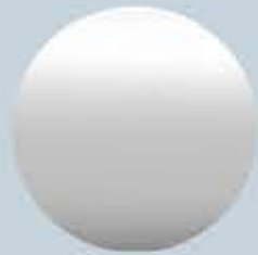
WHITE (FOR SPIRIT PRO)