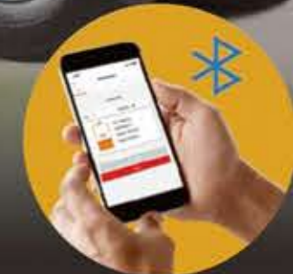
Mobile & PC Live Monitor App