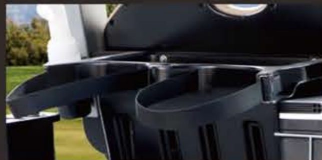
Golf Bag Holder

The TARA has flowing contours that are crafted in your choice of premium materials, depending on how you wish to configure your golf cart or accentuate the interior. A wide array of add-on accessories available for both golfing and personal use.