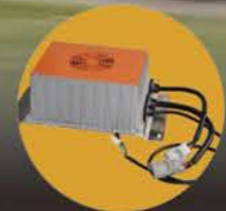
25A Adaptive On-board Charger (FOR ROADSTER 2+2 & EXPLORER 2+2)