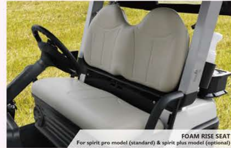
FOAM RISE SEAT For spirit pro model (standard) & spirit plus model (optional)

Built with robust injection molding, TARA is equipped with grab handles, an under-canopy storage compartment, and designated spots for GPS, speakers, enclosure, light stripe, and more. Designed for durability and convenience, it ensures both protection and accessibility for your gear during your journeys.