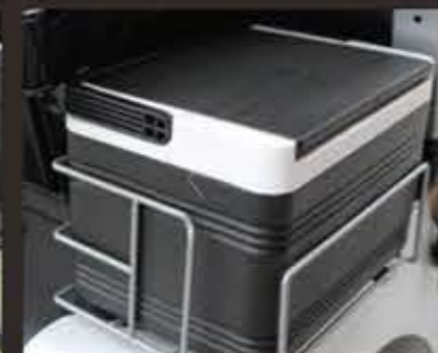
Caddy Master Cooler