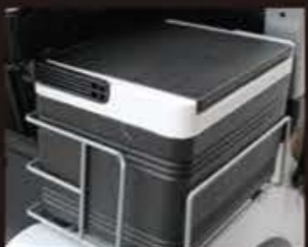
Caddy Master Cooler