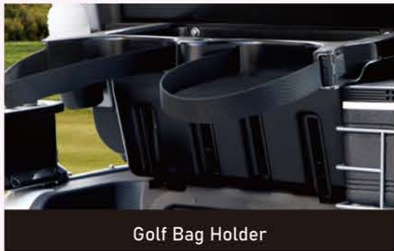
Golf Bag Holder

Keeps you ready for golfing. Holds multiple golf balls.