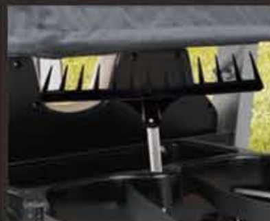
Optional Sand Trap Rake Kit