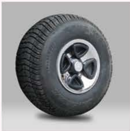
HARMONY TIRE 8" IRON WHEEL 18/8.5-8 TIRE