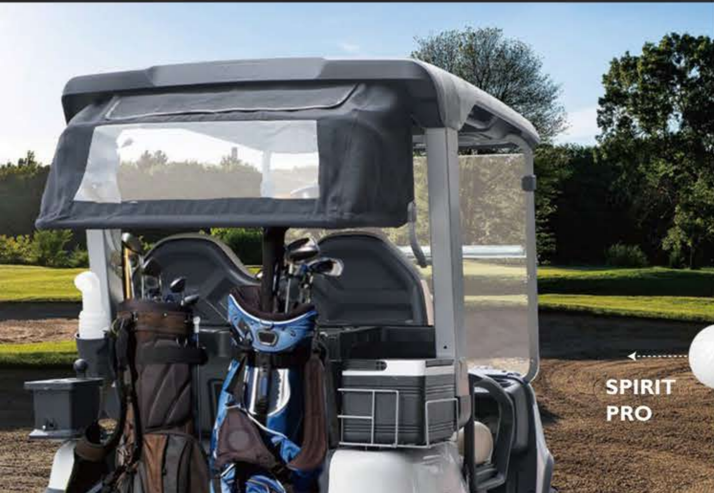
← SPIRIT PRO