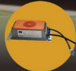
17A Adaptive Charger (FOR SPIRIT PRO & SPIRIT PLUS & HARMONY)