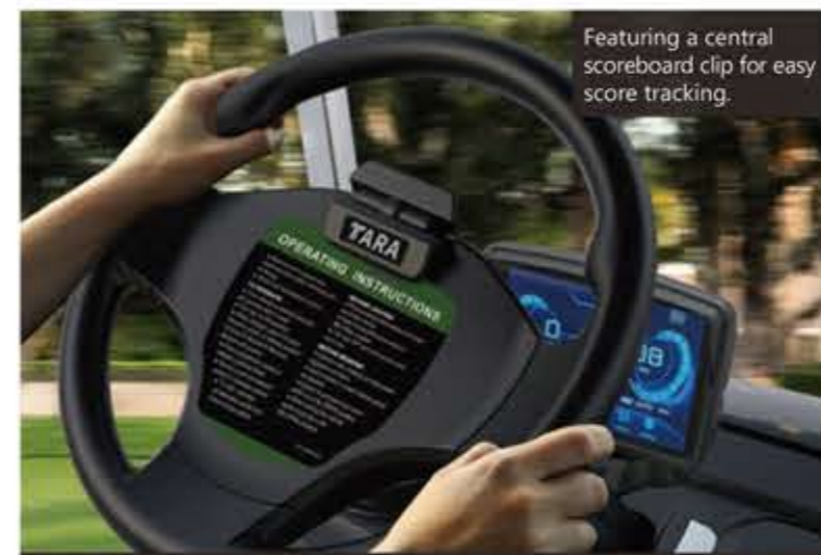
Featuring a central scoreboard clip for easy score tracking.

Tara's sleek exterior and modern interior elevate your golfing experience. The redesigned interior is engineered to minimize noise and prevent items from sliding, securely holding drinks, tees, golf bags, cellphones, and gloves. Additionally, Tara keeps you well-informed about the golf cart's status, ensuring a seamless and informed outing on the green.