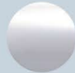
MINERAL WHITE (FOR SPIRIT PLUS)