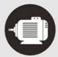
AC Induction Motor