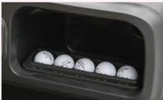
STORAGE COMPARTMENT WITH GOLF BALL HOLDER

Keeps you ready for golfing. Holds multiple golf balls.